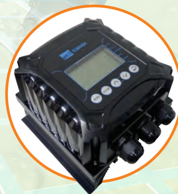
VFD-4500 Series Controller