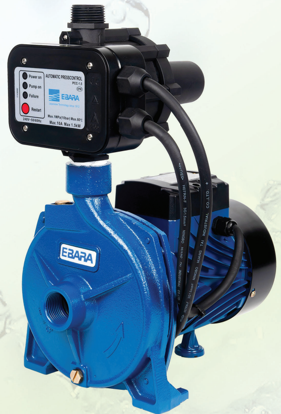
Model : PCM Booster